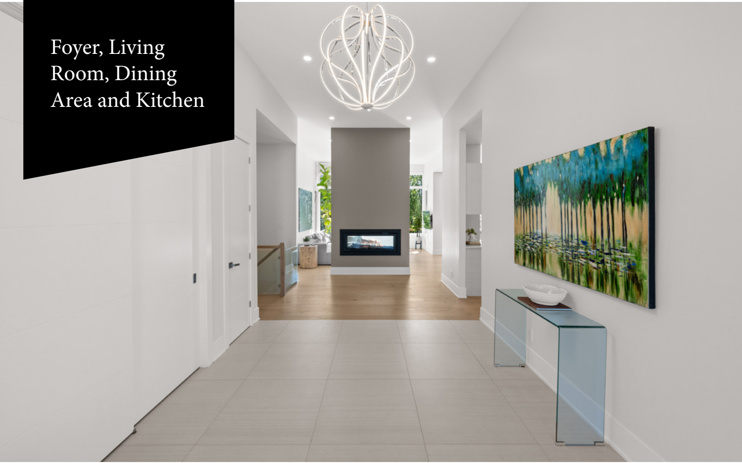
Foyer, Living Room, Dining Area and Kitchen