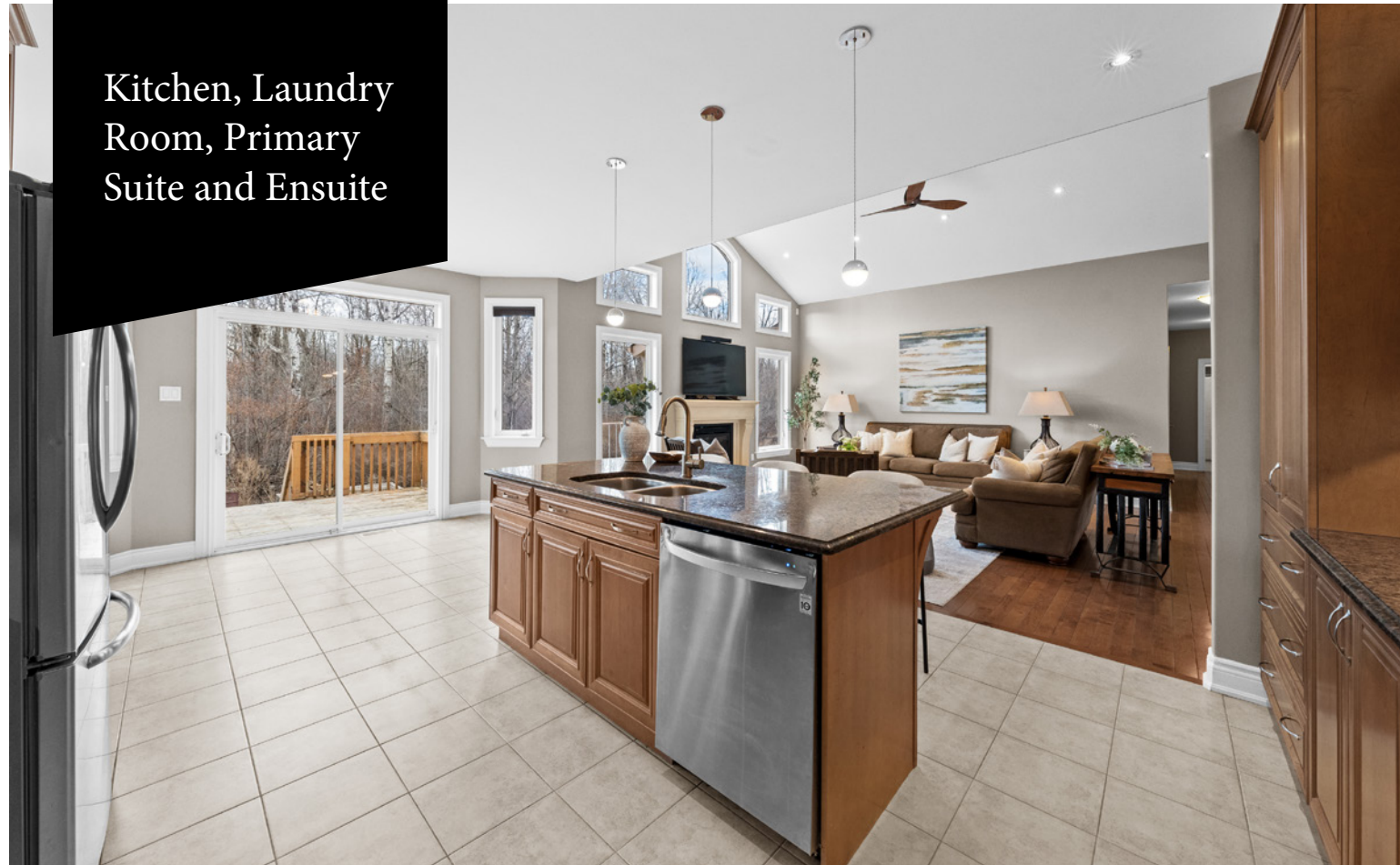
Kitchen, Laundry Room, Primary Suite and Ensuite