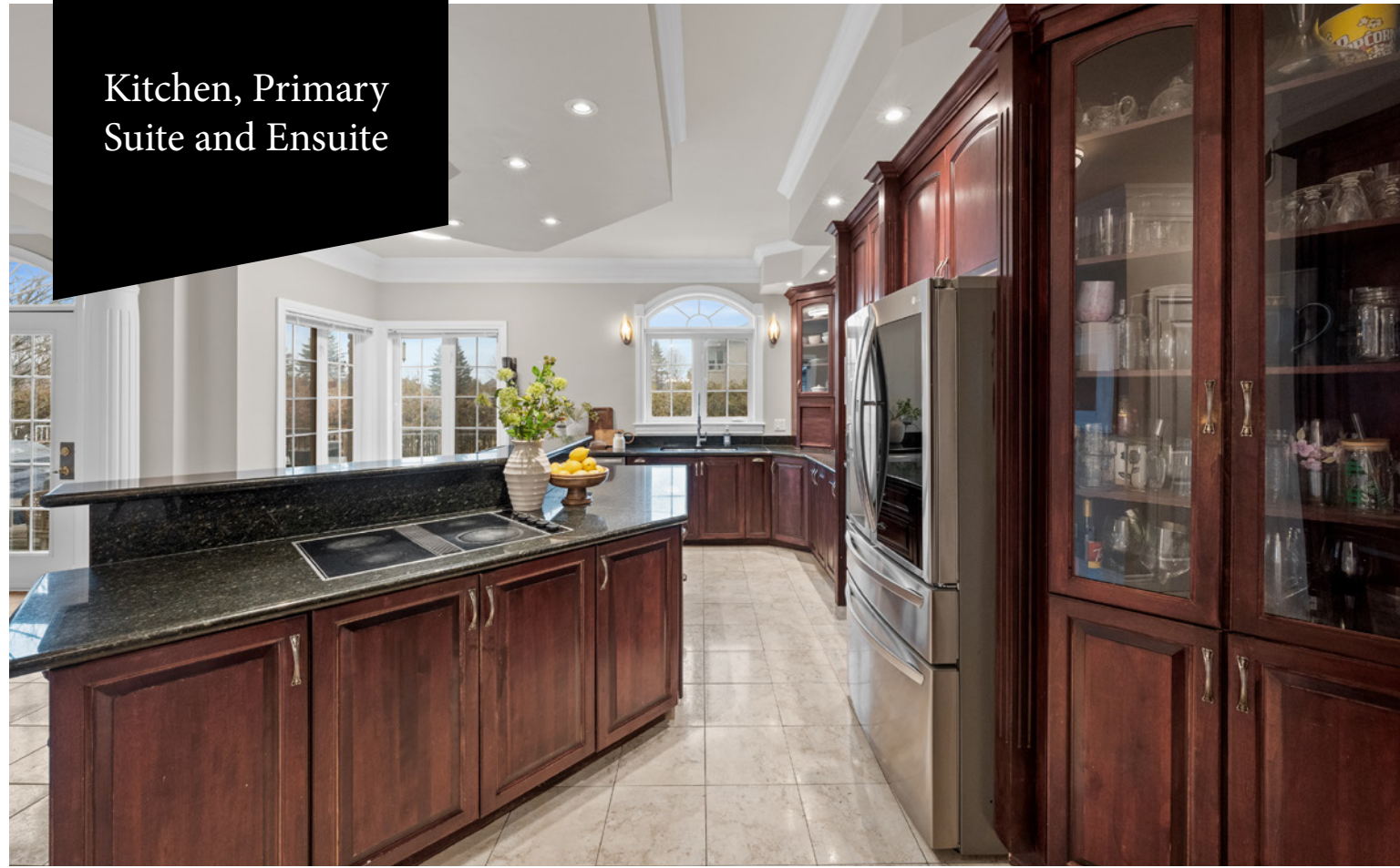
Kitchen, Primary Suite and Ensuite