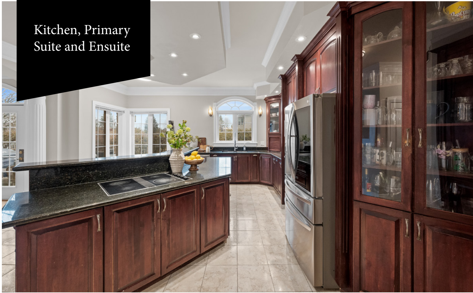
Kitchen, Primary Suite and Ensuite