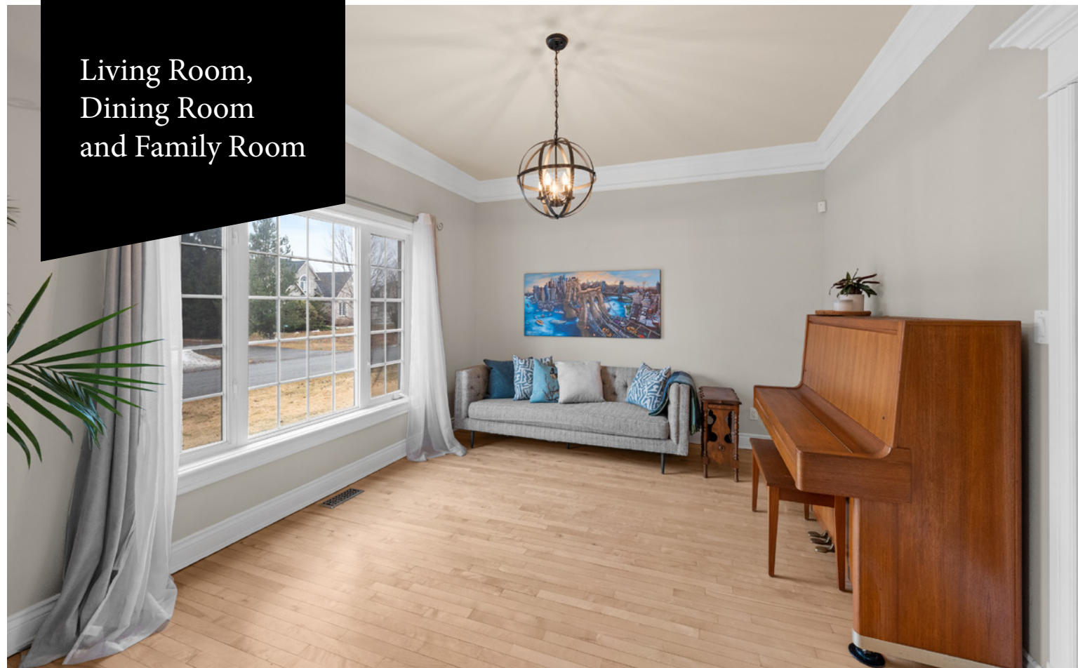
Living Room, Dining Room and Family Room