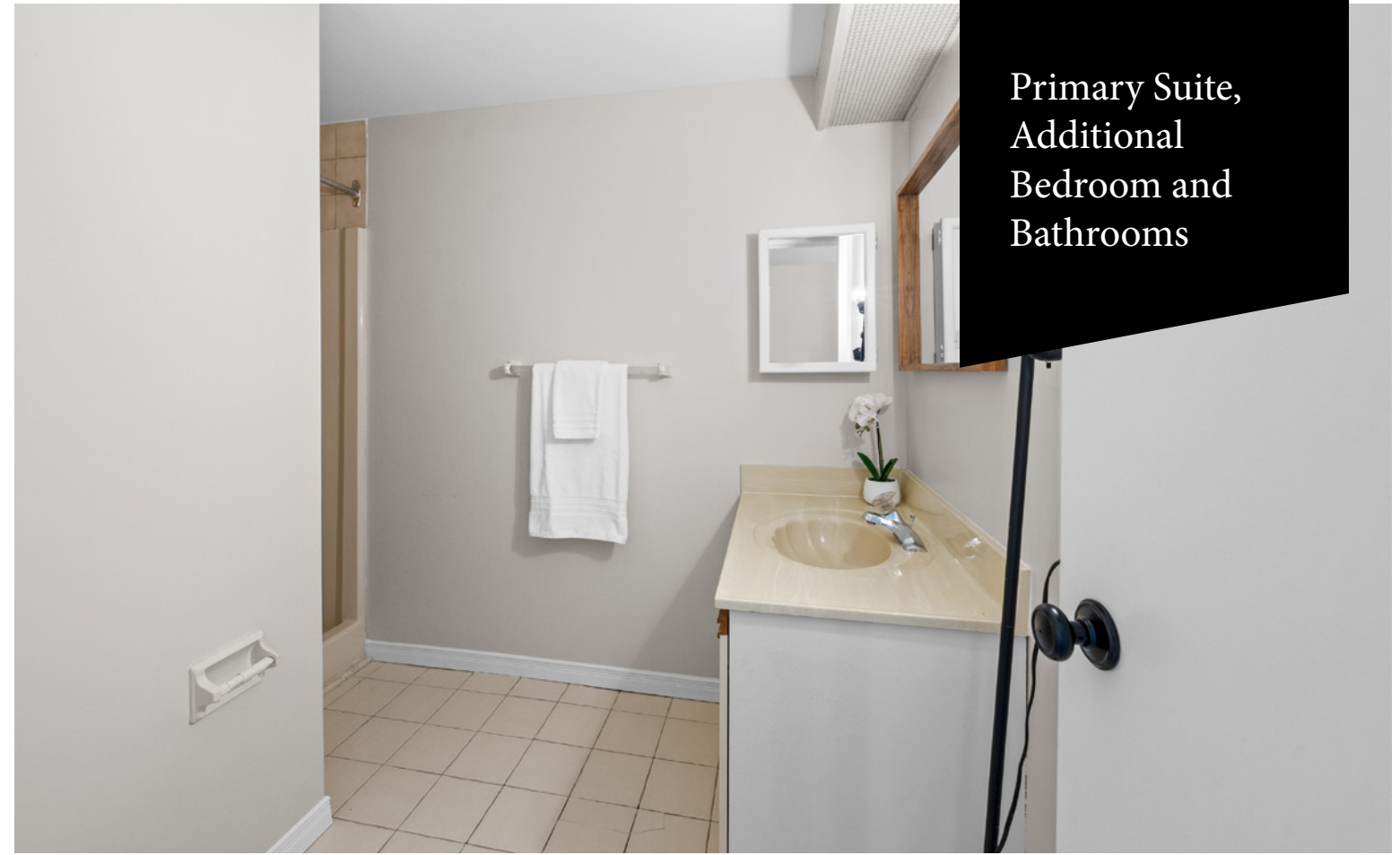
Primary Suite, Additional Bedroom and Bathrooms