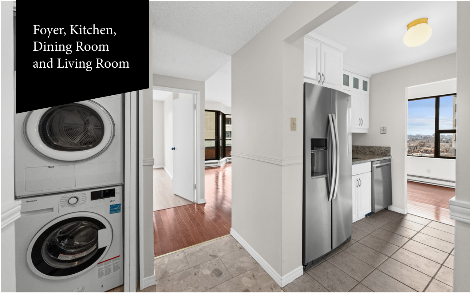
Foyer, Kitchen, Dining Room and Living Room