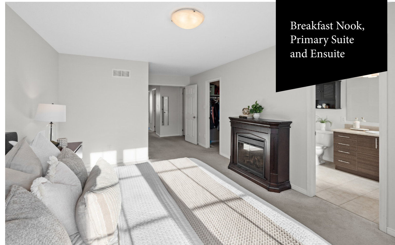
Breakfast Nook, Primary Suite and Ensuite