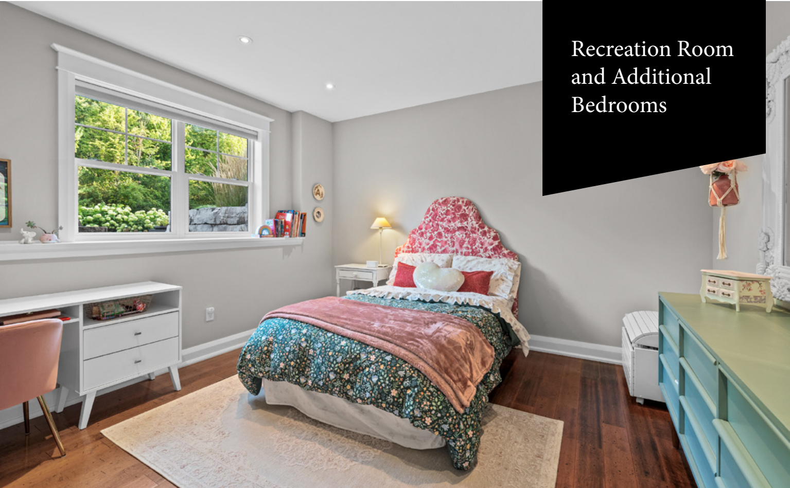
Recreation Room and Additional Bedrooms