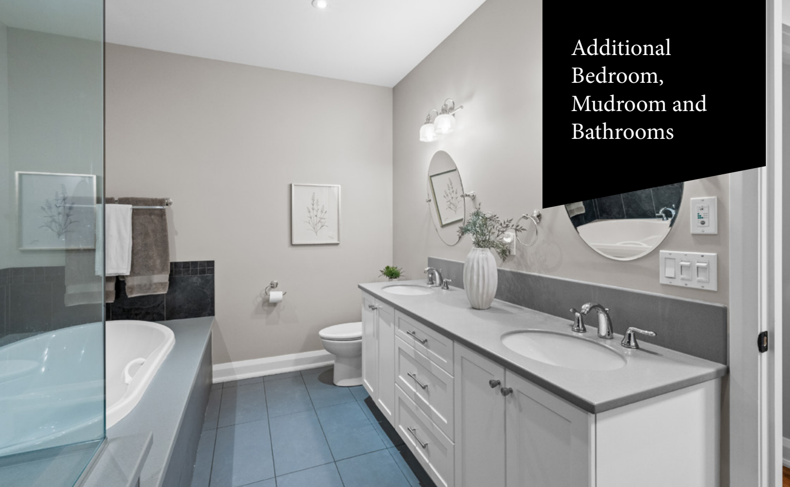
Additional Bedroom, Mudroom and Bathrooms