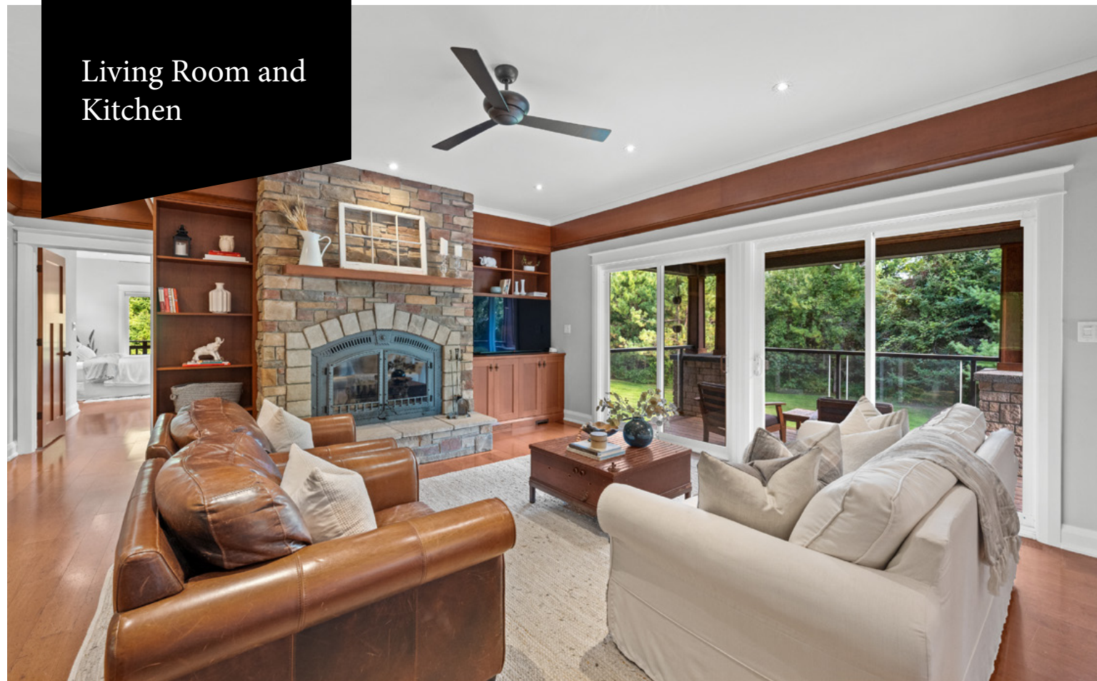
Living Room and Kitchen