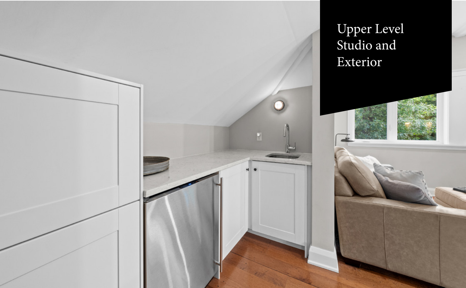
Upper Level Studio and Exterior