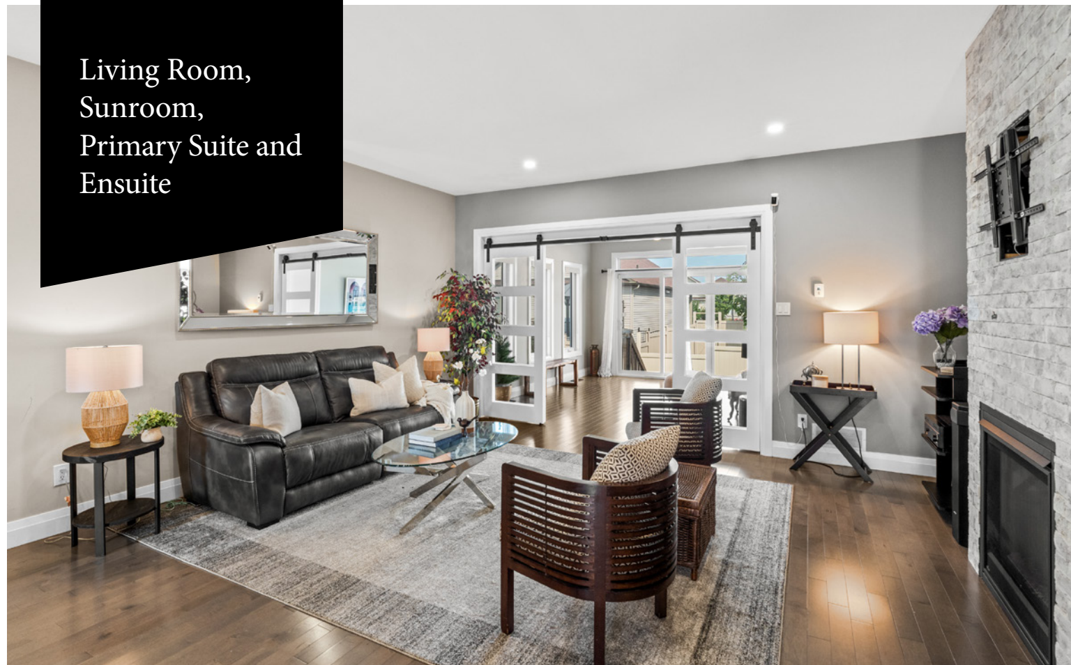
Living Room, Sunroom, Primary Suite and Ensuite