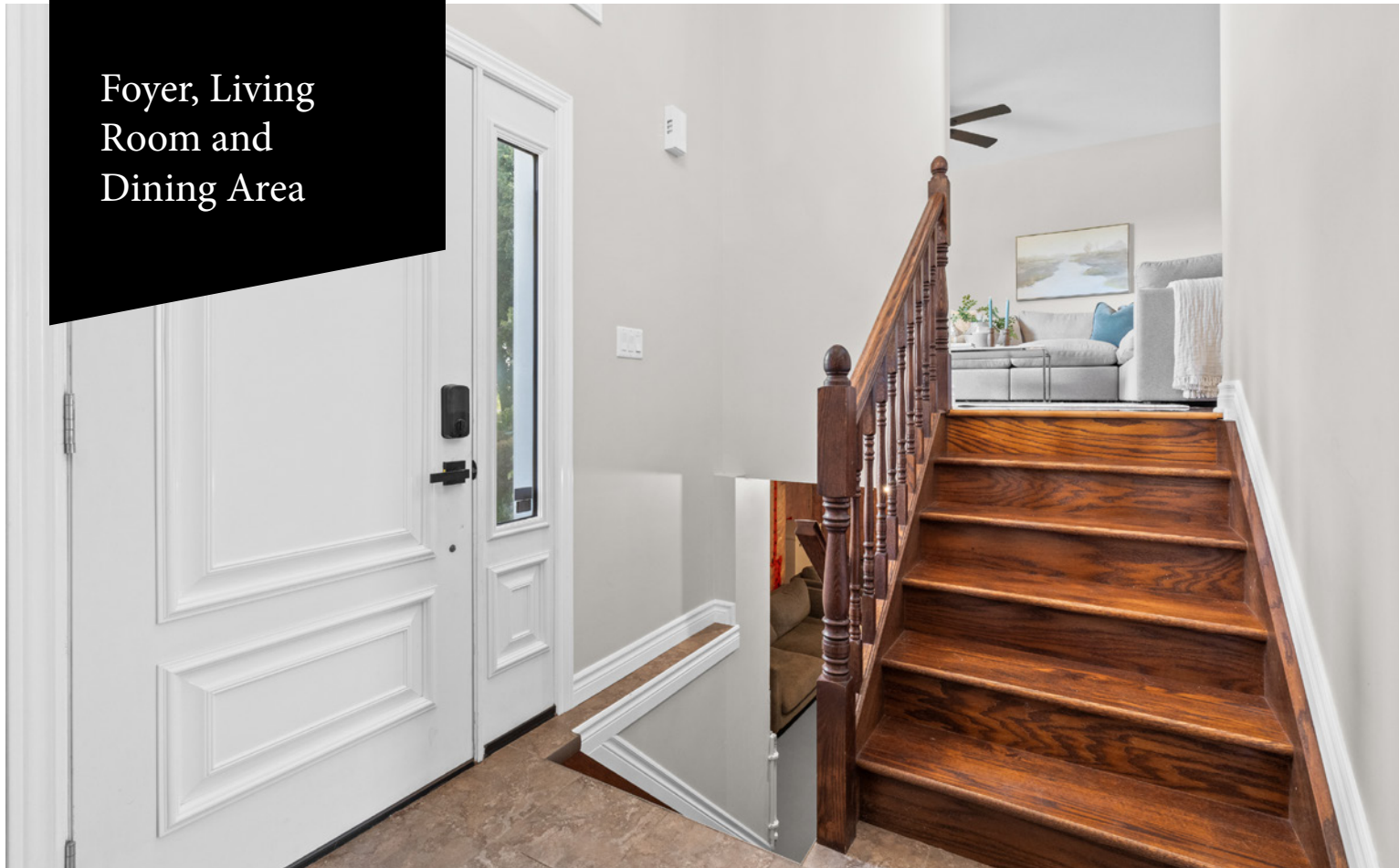
Foyer, Living Room and Dining Area