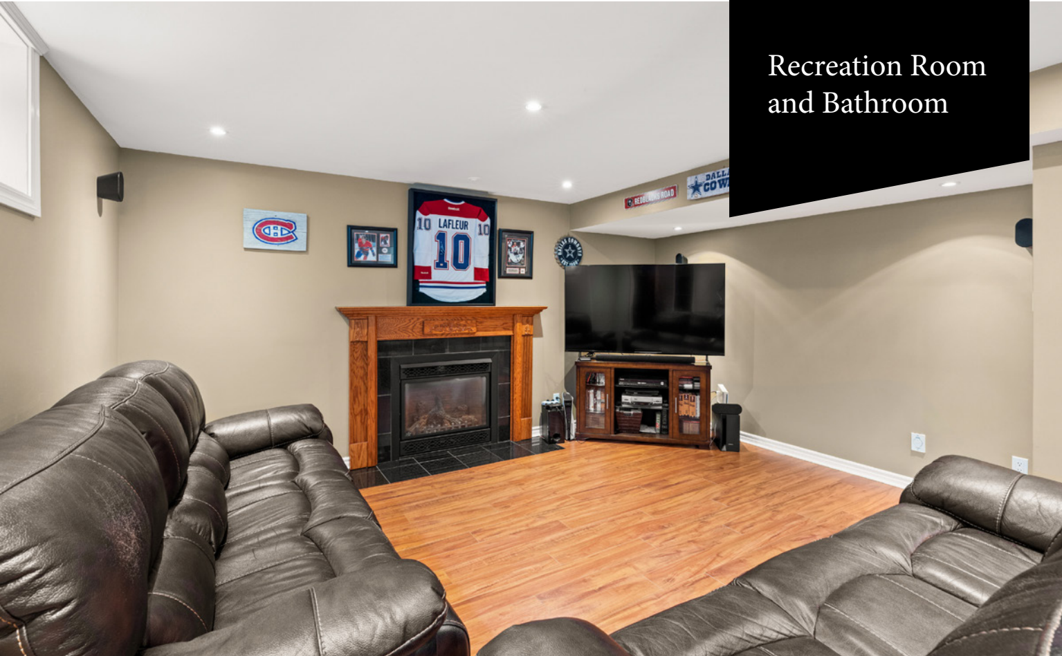
Recreation Room and Bathroom