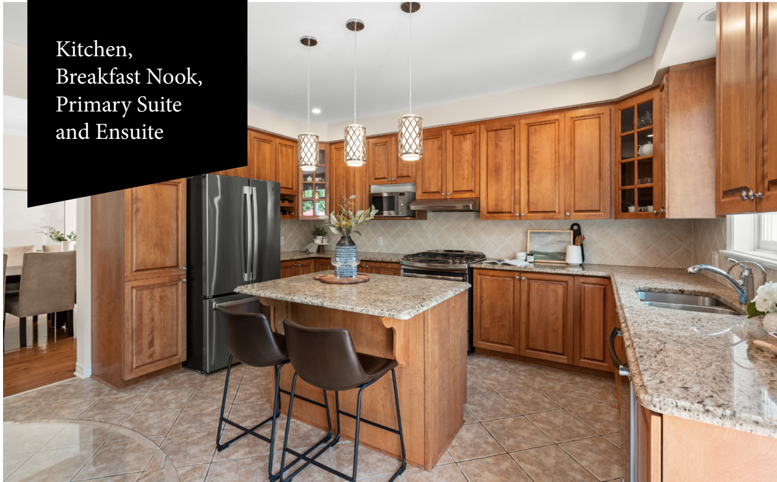
Kitchen, Breakfast Nook, Primary Suite and Ensuite