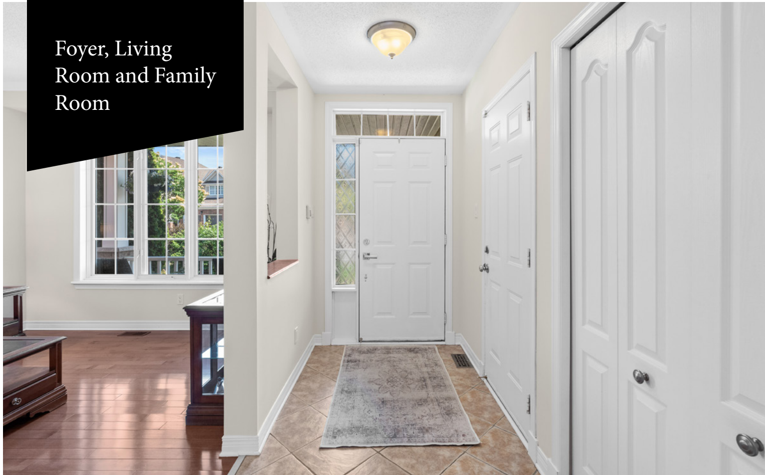
Foyer, Living Room and Family Room