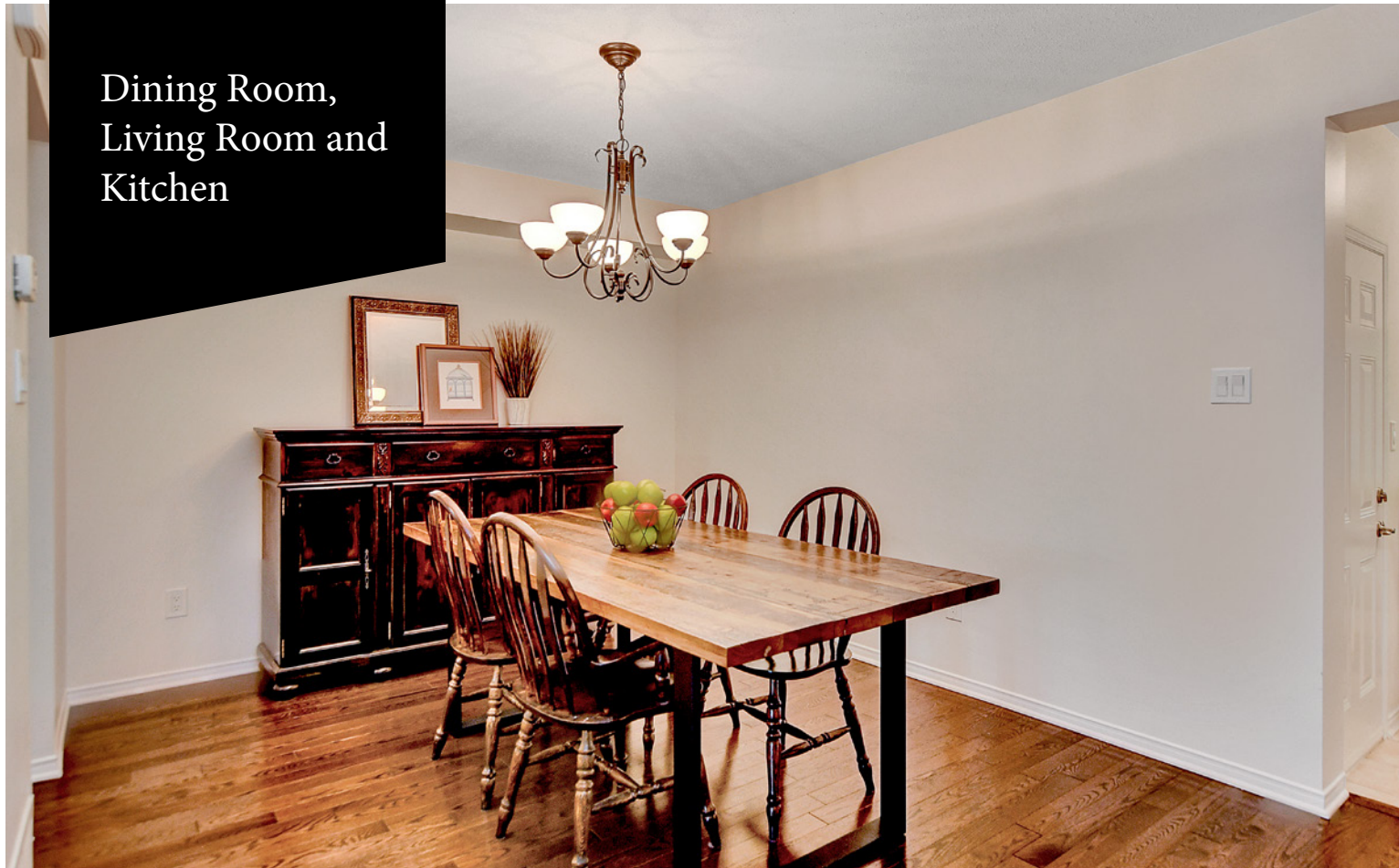
Dining Room, Living Room and Kitchen