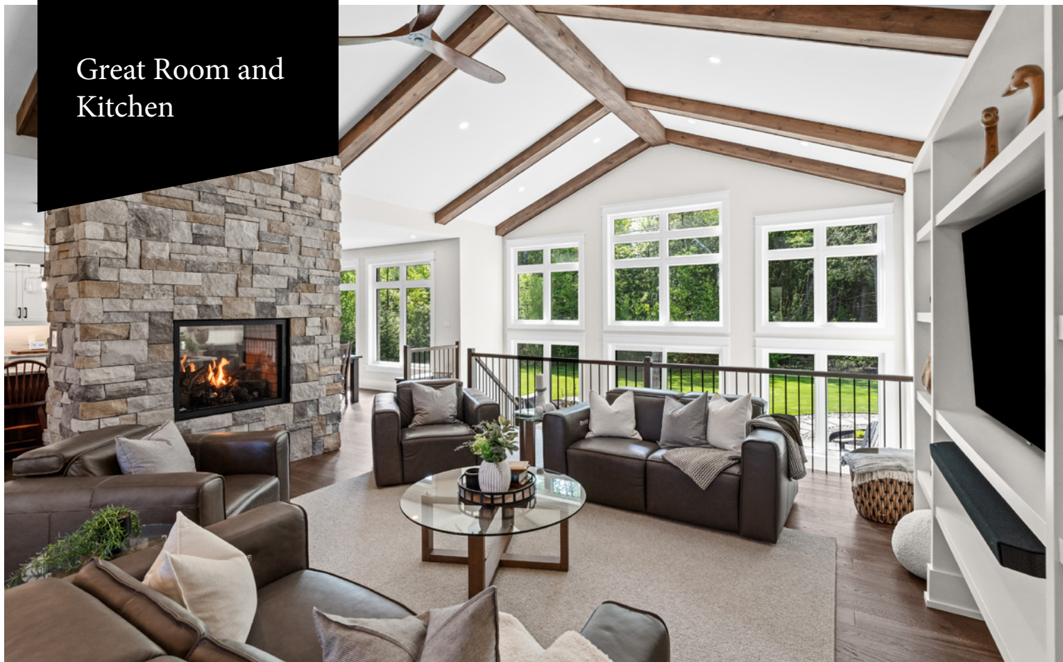
Great Room and Kitchen