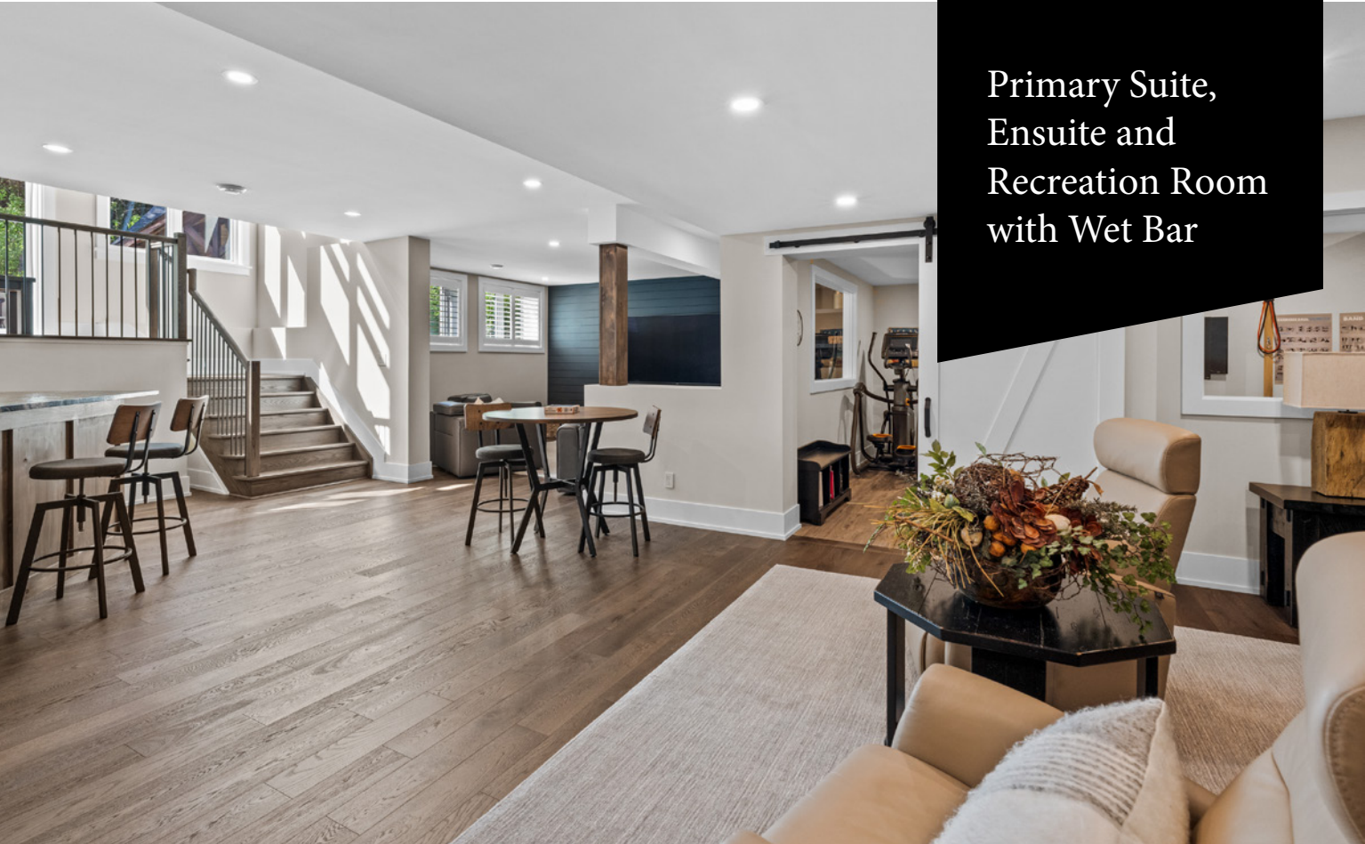
Primary Suite, Ensuite and Recreation Room with Wet Bar