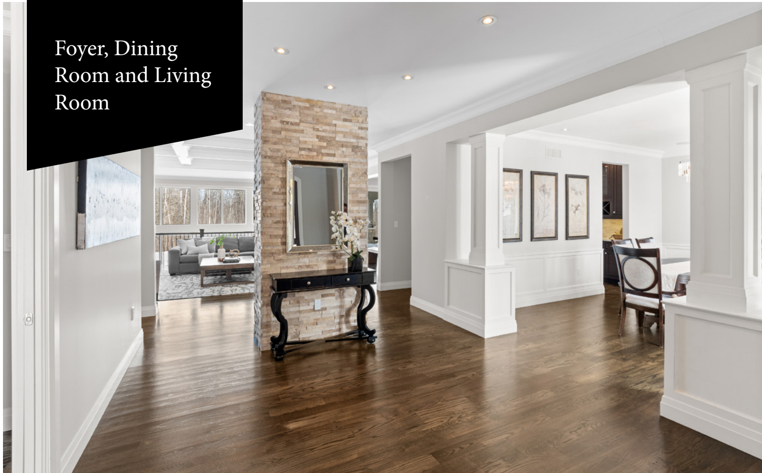
Foyer, Dining Room and Living Room