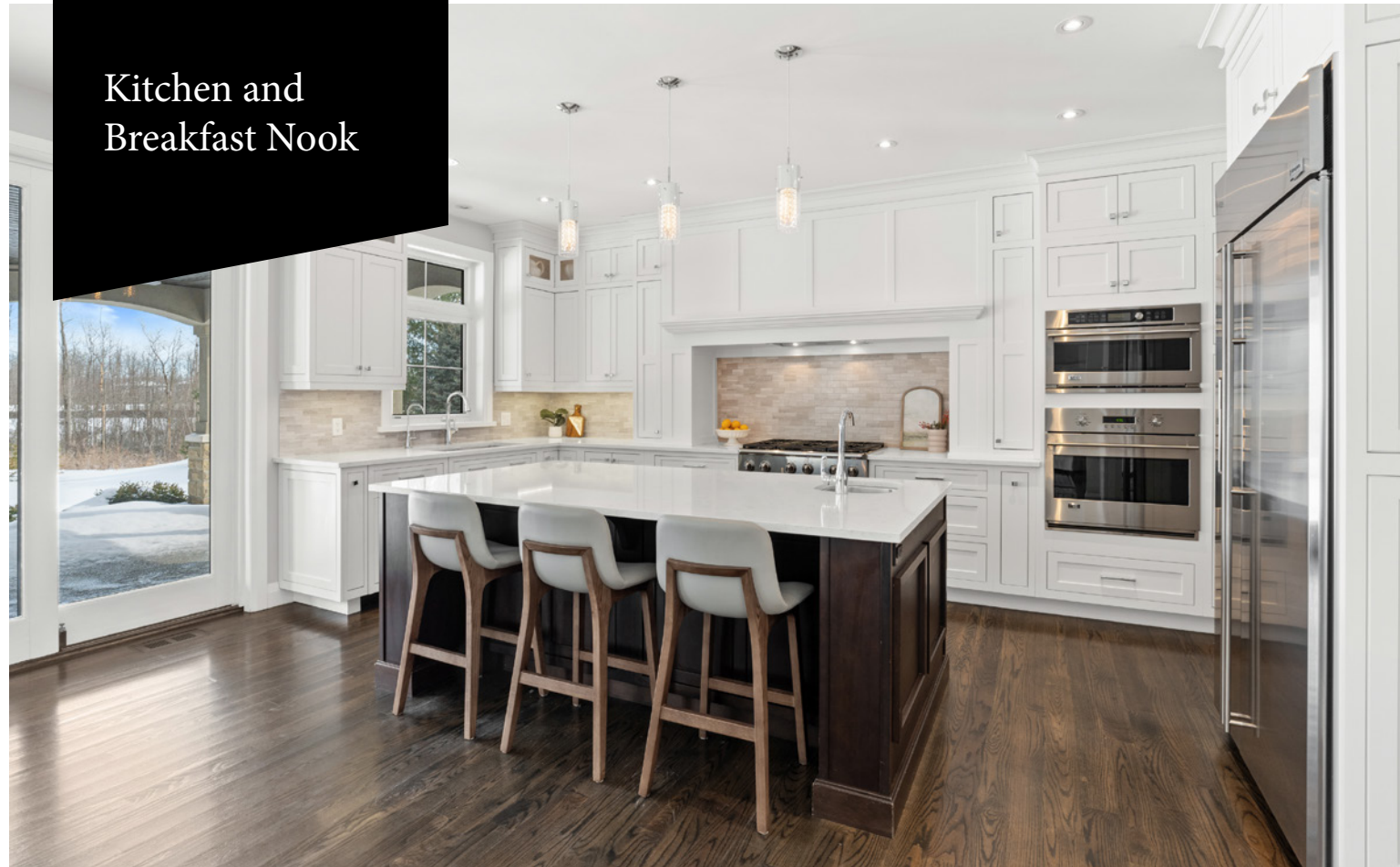
Kitchen and Breakfast Nook