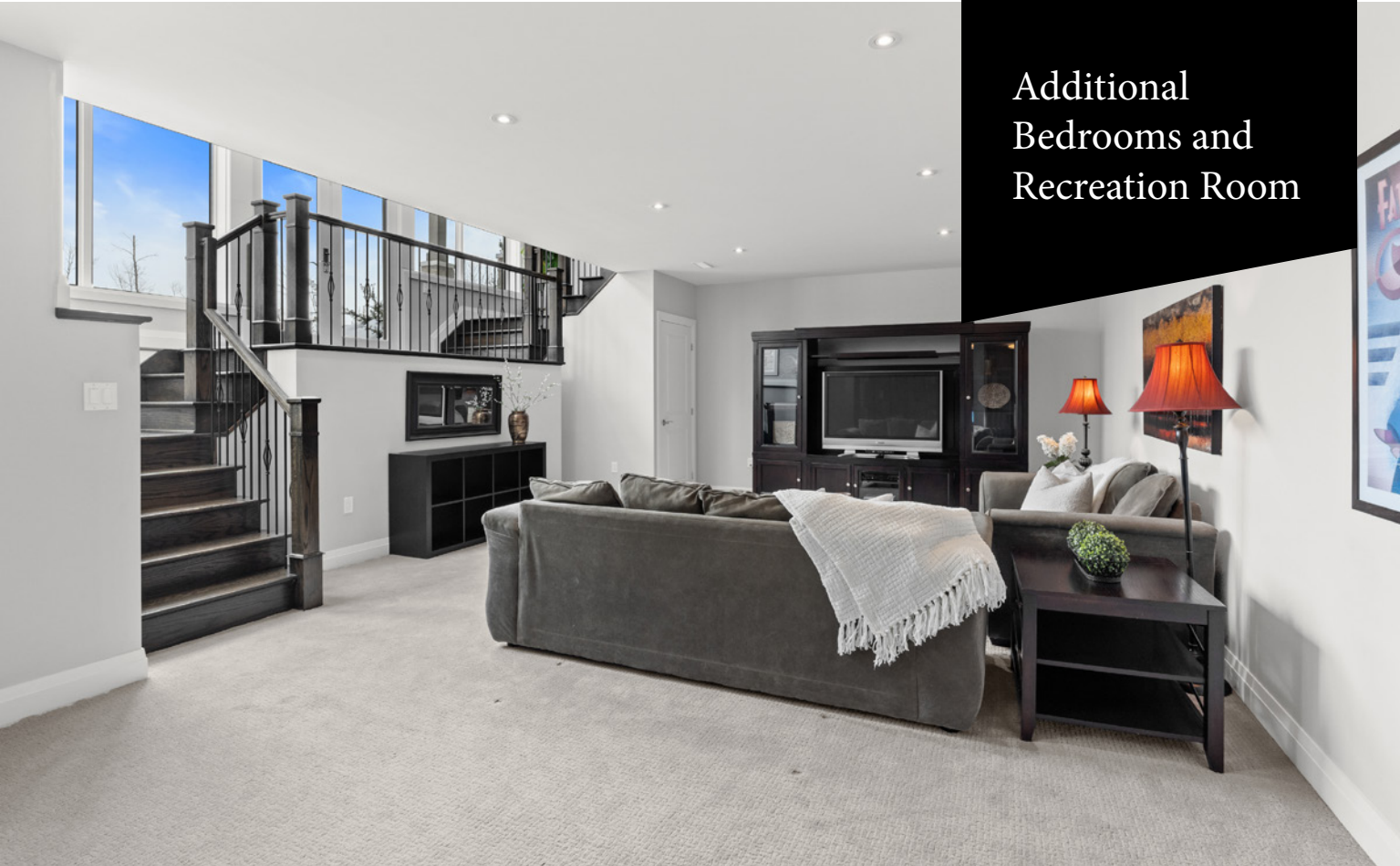
Additional Bedrooms and Recreation Room