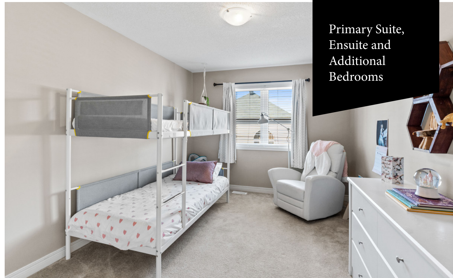
Primary Suite, Ensuite and Additional Bedrooms