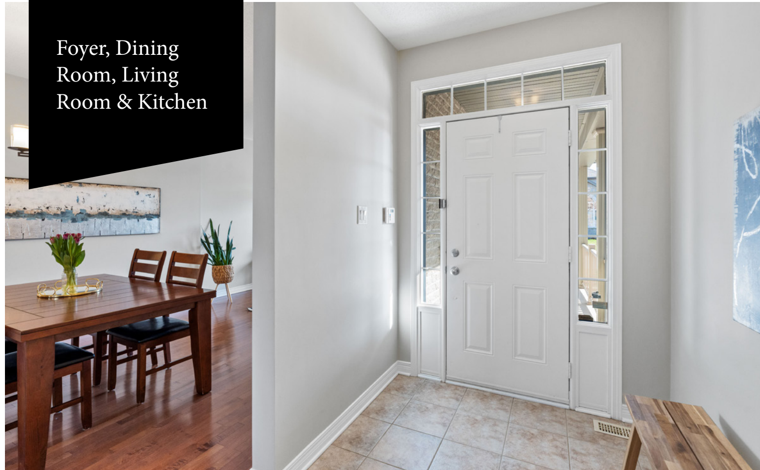
Foyer, Dining Room, Living Room & Kitchen