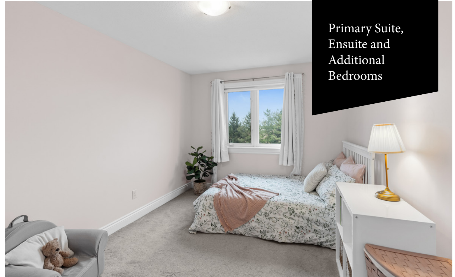
Primary Suite, Ensuite and Additional Bedrooms