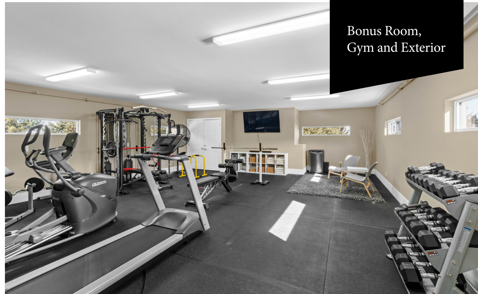
Bonus Room, Gym and Exterior