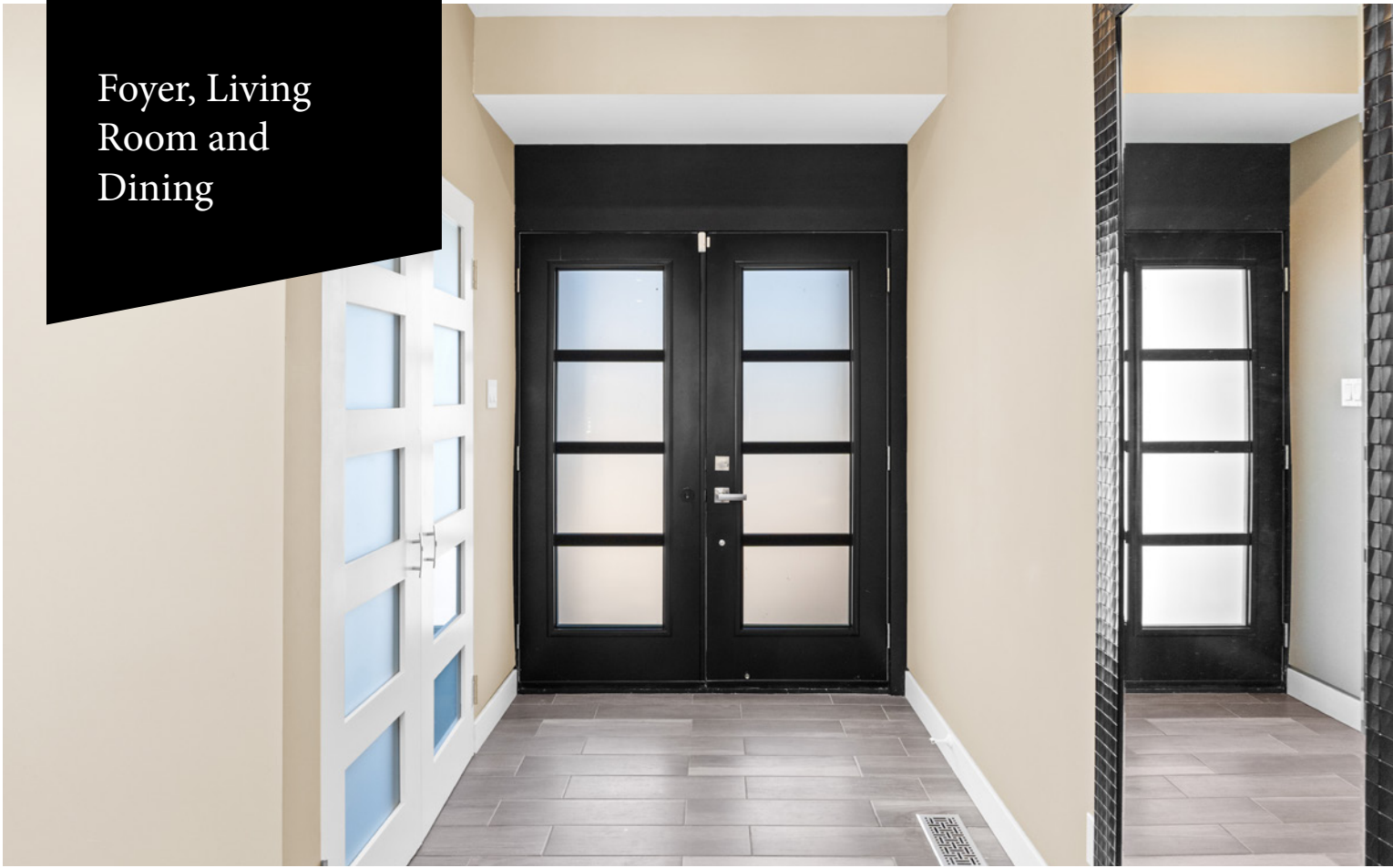
Foyer, Living Room and Dining