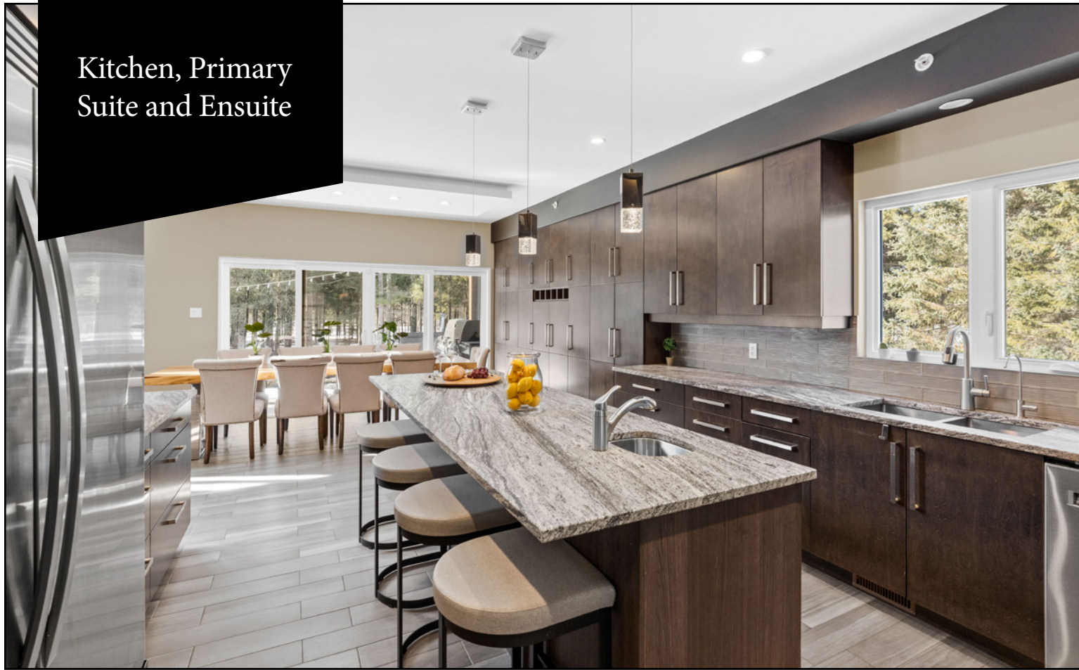
Kitchen, Primary Suite and Ensuite