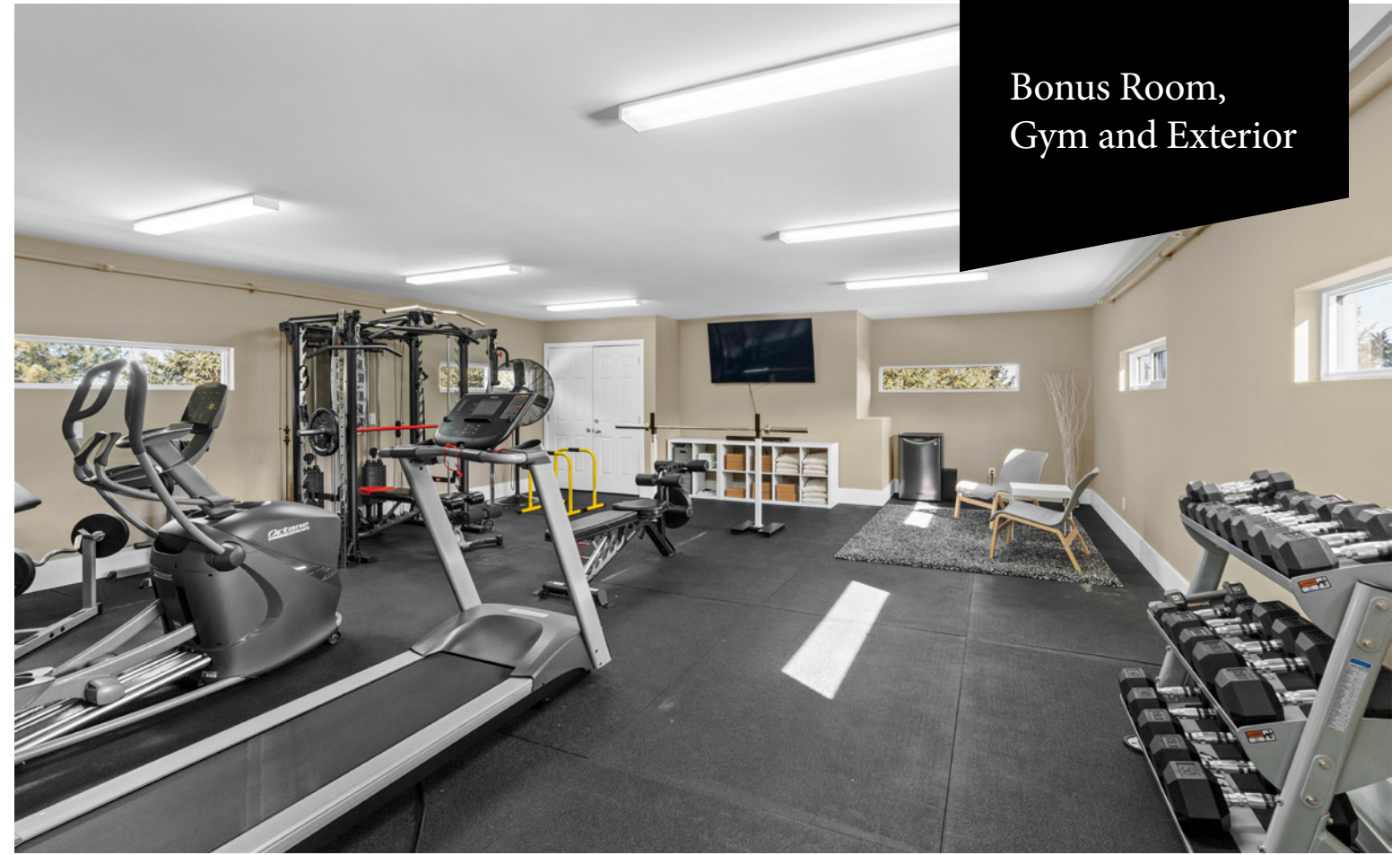
Bonus Room, Gym and Exterior