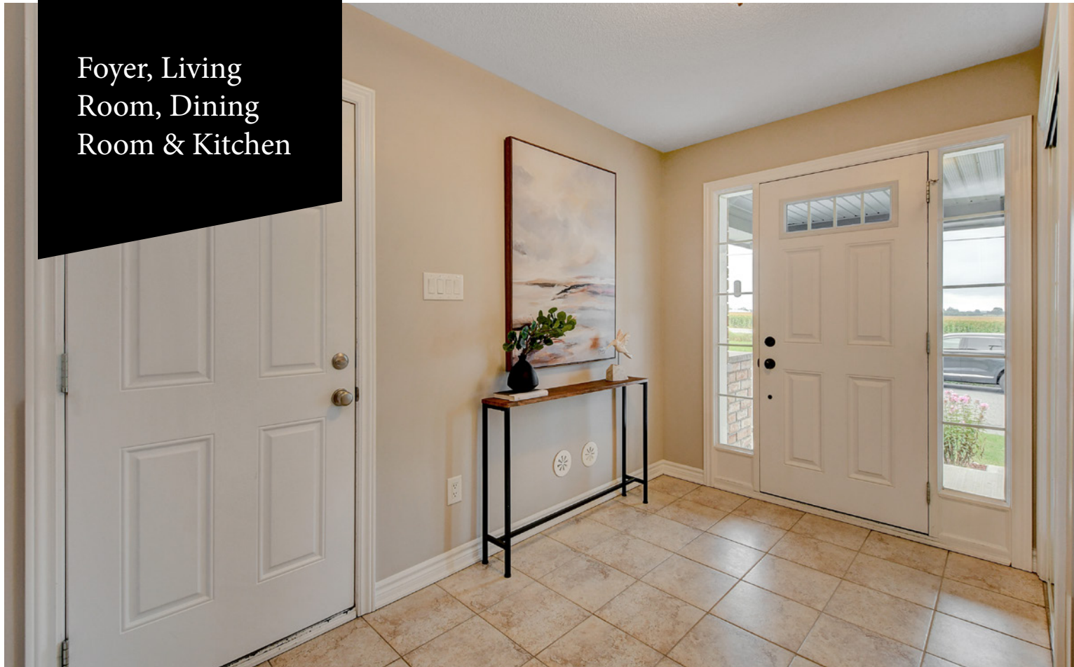
Foyer, Living Room, Dining Room & Kitchen